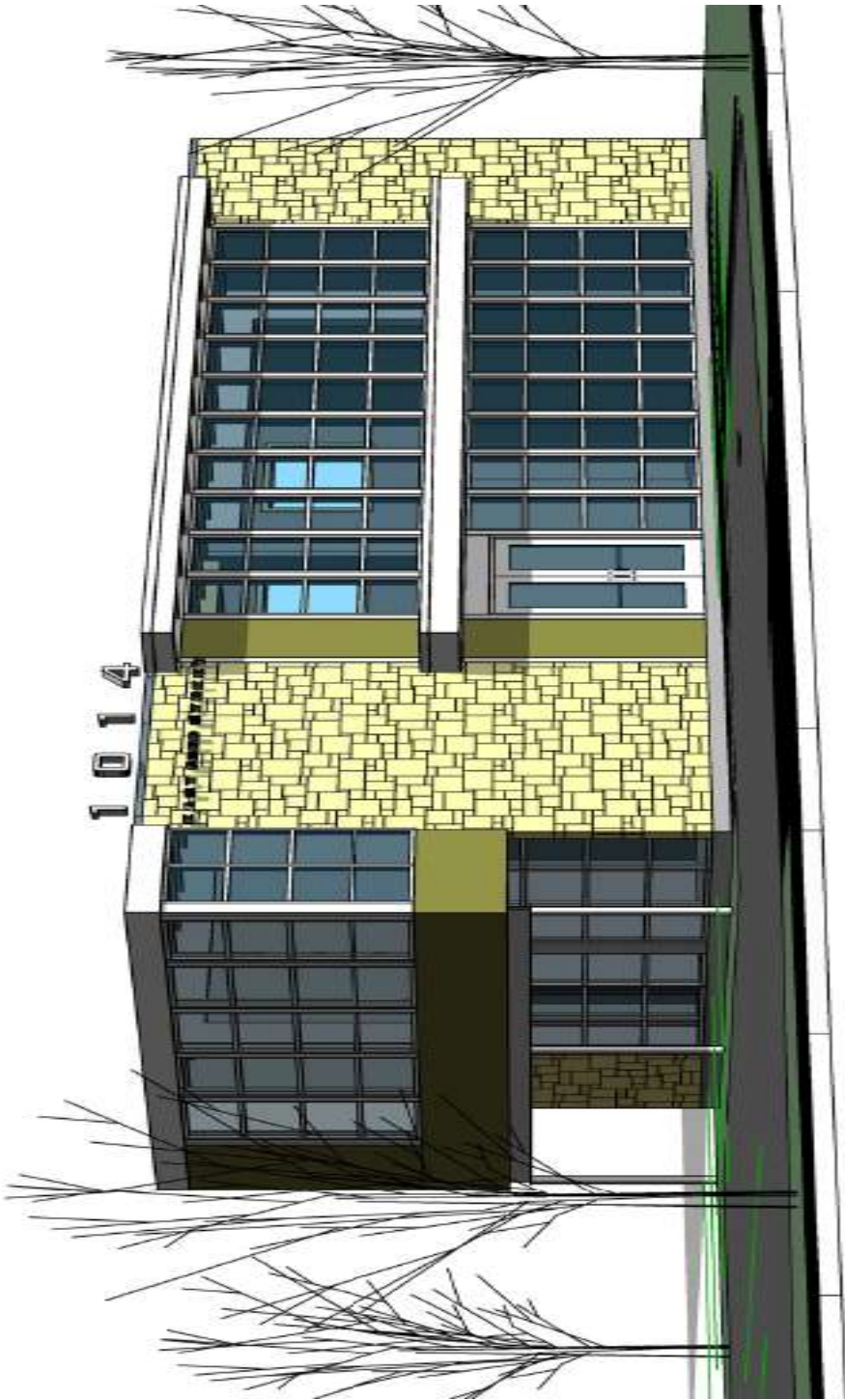
① perspective view